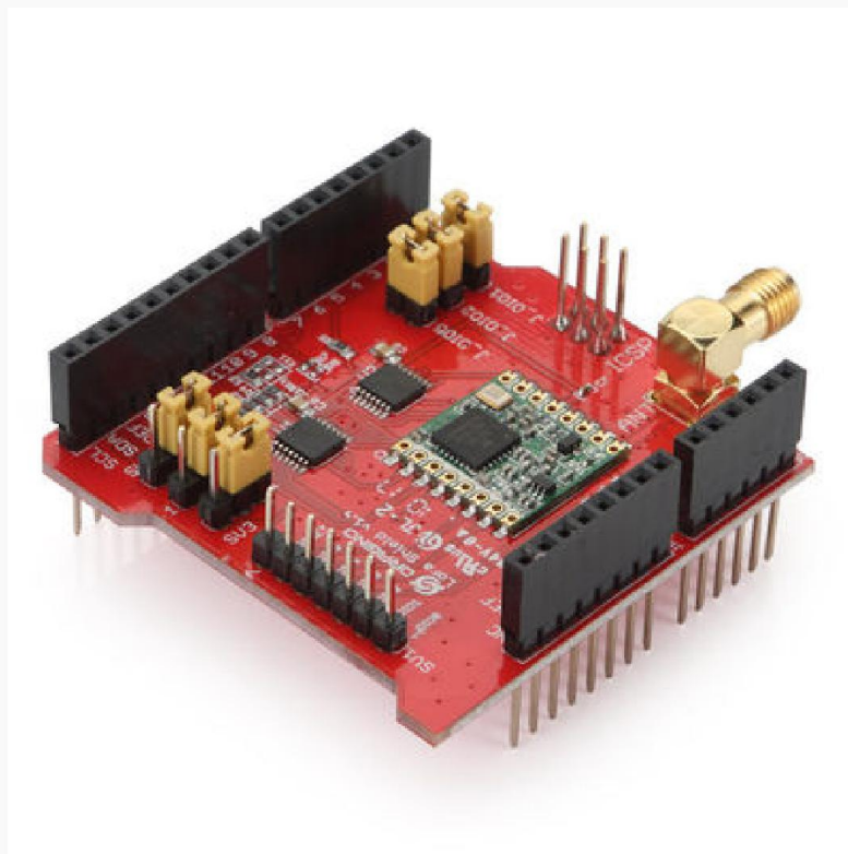
Dragino LoRa Shield v1.4