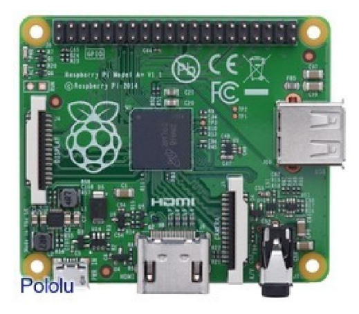
Raspberry Pi 1 Model A+, top view.