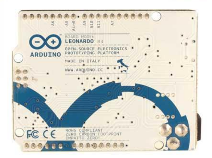
Arduino Leonardo Front with headers