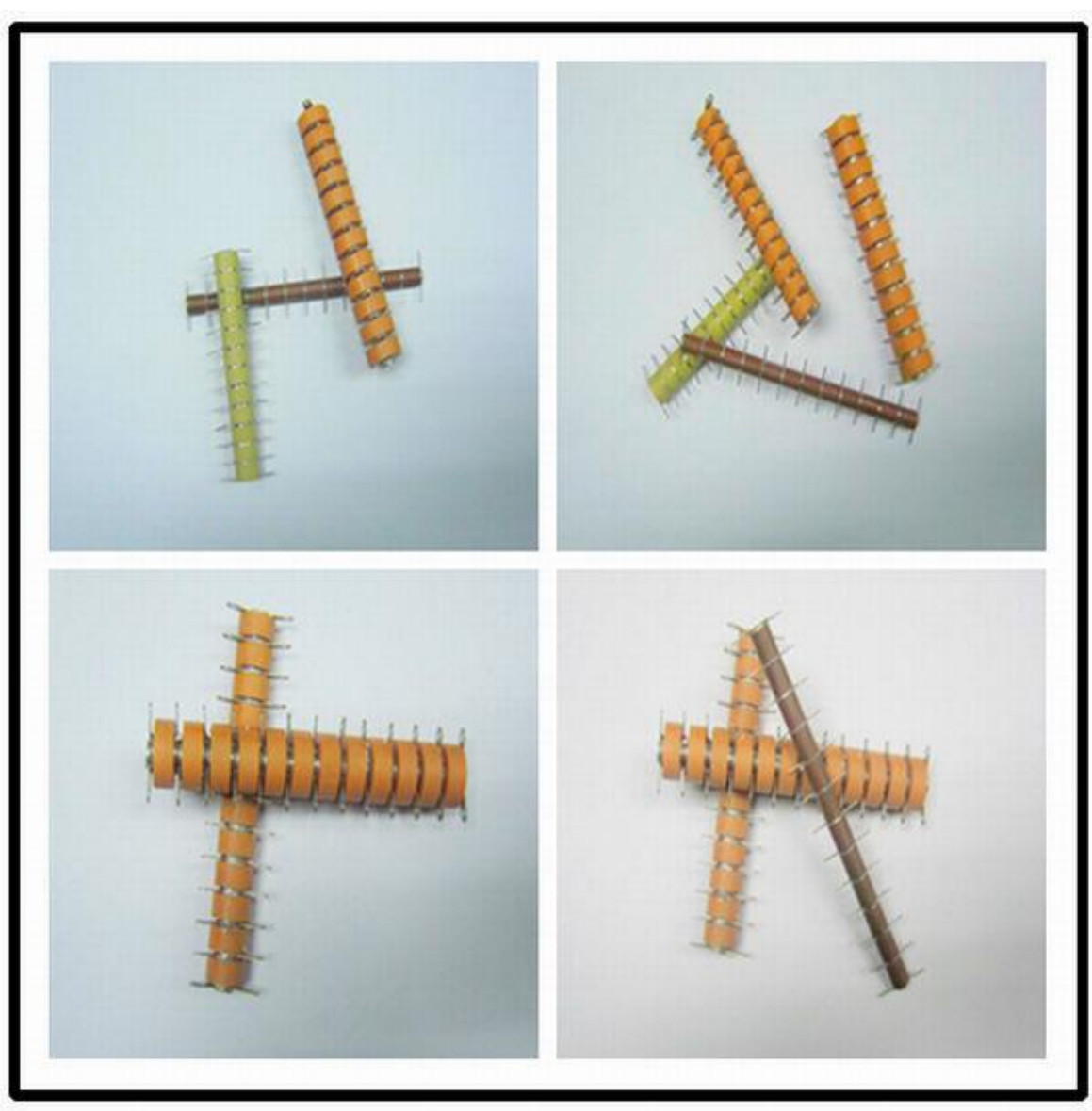
High Voltage Linear Capacitor 20KV 150pf /general electric capacitor

Dongguan Amazing Electronic Co.,Ltd. is specializing in manufacturing various kinds of high voltage and high frequency ceramic capacitors.Welcome to contact us for further information.